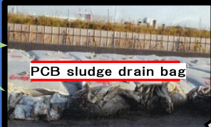
PCB sludge drain bag